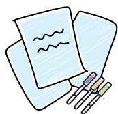
Paper and pens

Begin by working through the worksheets (Getting away from unpleasant thoughts and How can we change the thought?). There's lots in there, so allow time, encourage discussion and examples with plenty of thinking time to come up with different ways to deal with different thoughts. There is a more detailed version of these worksheets in the 13-16 age range that includes reframing, which may suit some young people better.